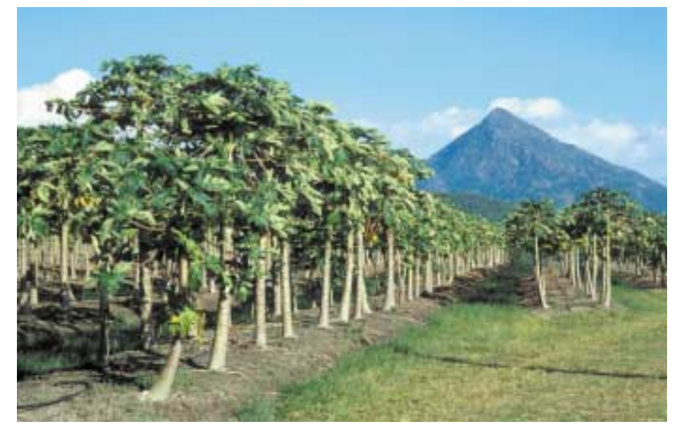
Best-management practices are being developed for growers in high-risk industries to minimise cadmium in agricultural and horticultural produce. They include soil and irrigation testing for salinity, addition of trace element fertilisers or liming agents, crop rotations to boost soil organic matter, and changes in crop type or variety to minimise cadmium uptake.

Cadmium is a naturally occurring trace element that is present at low levels in all soils, rocks, waters, plants and animals. It exists in relatively high concentrations in