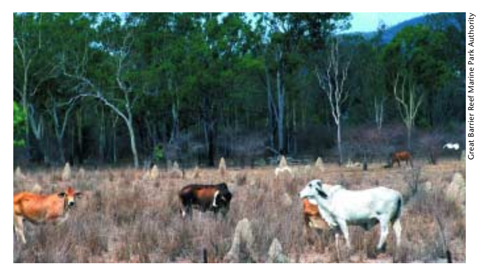
Most of the collective sediments and nutrients reaching the coast come from cattle grazing lands in the drier catchments of the Burdekin and Fitzroy rivers.

recruitment, greater mortality of juvenile corals and displacement of the dominant hard corals, which build the reef framework, by algae.