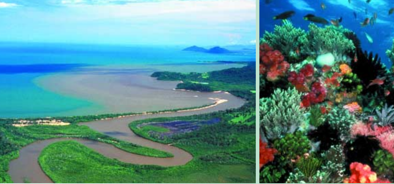
Most pollutants from the land are delivered to the Great Barrier Reef Heritage Area during floods caused by passing tropical cyclones and monsoonal rainfall. As the rivers reach the coast, billowing flood plumes with elevated sediment and nutrient loads appear. Approximately 200 near-shore reefs are under pressure due to regular exposure to flood plumes.