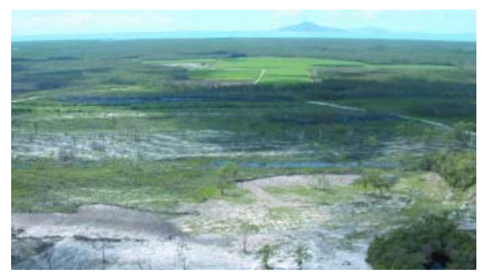
Land clearing is the primary cause of erosion and nutrient loss in the Great Barrier Reef catchment. About half the catchment has been cleared since 1850.