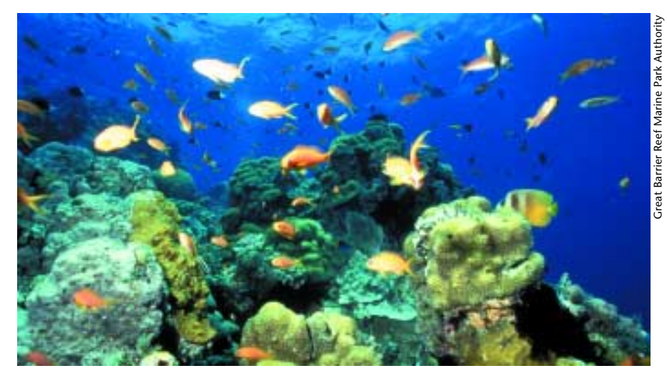
When corals are experimentally exposed to high levels of nutrients, direct effects have included reduced settlement success (coral larvae need to find a place to live), disruption of reproduction and changes in coral growth and calcification.

Diuron has been detected in inter-tidal seagrasses and is a potential threat to these habitats. It has been speculated that the dramatic decline in dugong, which feed on seagrass, may be partly due to changes brought about by lower water quality.