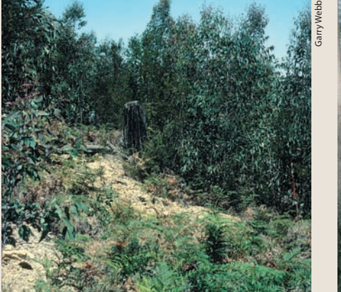
Left: forest regenerating four years after intensive logging in 1976. Right: regrowth forest 22 years after logging.

The survey team found that most bird species that foraged among canopy foliage, in the air, among the understorey and on the ground had recovered within 22 years of logging. Five of these species were significantly more abundant in the logged coupes, including the bell miner ( Manorina melanophrys ), which is often associated with disturbed forest. However,