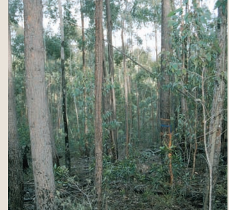
contributing to the capacity of the unlogged coupes to support additional bird species.

The team also observed a change in the bird populations across both logged and unlogged coupes over time. This suggested that the forest regrowth on logged coupes had recovered to the stage where it was