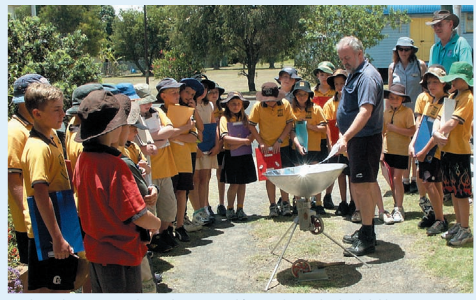
A solar Stirling prototype being demonstrated for Maryborough school children. CTI/Glymn/Olds

graphite (as a heat conductor). This cell can store 9.5 times more energy than the same sized lead-acid battery used in photovoltaic systems. It can also store 100% of the solar energy directed into it, compared to only 15% for photovoltaics.