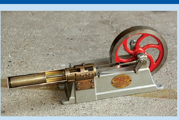
A cut away of a beta type Stirling engine, showing the displacer, power piston and crank with flywheel. Peter Olds

In another solarpowered Stirling engine, hydrogen is alternately heated and cooled to drive a piston up and down, converting solar heat to electricity. The system is closed (no fuel or cooling