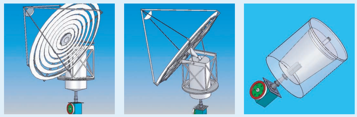
Left to right: The system's innovative solar dish uses polished stainless steel rings. The back of the solar dish showing placement of the salt cell tank which in turn connects to the Stirling generator below. Detail of the salt cell tank and generator. NetlAmstrong

An innovative Australian spin on the simple age-old technology of the Stirling engine could be the answer to one of our region's more pressing problems – the need for a cheap, portable, low maintenance renewable energy unit. The economical 'solar Stirling' generator is all the more remarkable for its combined desalination and heating or cooling capacity.