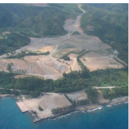
The Misima Mine plant site before (left) and after (right) deconstruction.

obligatory, fully engaged and comprehensive pre-operations Social Impact Study through to the extensive Mine Closure Plan implemented over the last three years, MML writes that its operations have been conducted with a thorough commitment to corporate, social and environmental integrity under its Sustainability Policy, and that the benefits of the gold mine for both Misimans and Papua New Guinea have been, and will continue to be, extensive.