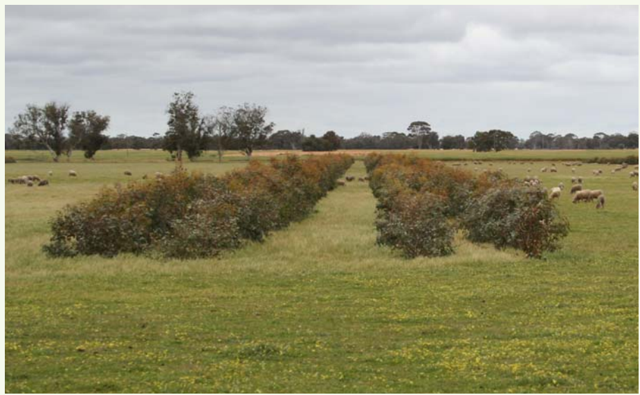
Clockwise from top left: The demonstration integrated wood processing plant running at Narrogin, WA. Mallee belts around a wheat crop in the Lake Toolibin catchment. Mallee belts do not require fencing for protection from sheep grazing. WA Conservation and Land Management

perennial woody crops that could be processed locally into industrial products,' Mr Bartle says.