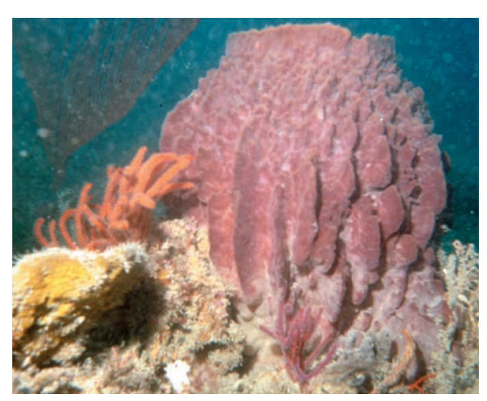
A large deepwater sponge and gorgonian corals off the Great Barrier Reef.

After more than 300 days sampling at sea, scientists for four major research agencies have begun compiling a rich picture of seabed life across