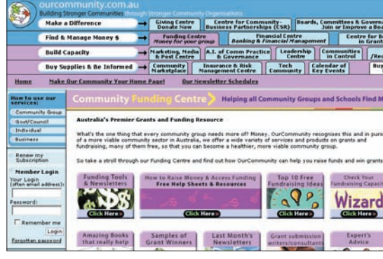
Our Community provides an online resources portal to support community initiatives.

Essentially a community-based GIS (geographic information systems) facility, the centre has been involved in some important resource management projects in the sugarcane-growing catchment of the Herbert in recent years and it still strives to facilitate productive communication between partners in the joint venture within the local region.