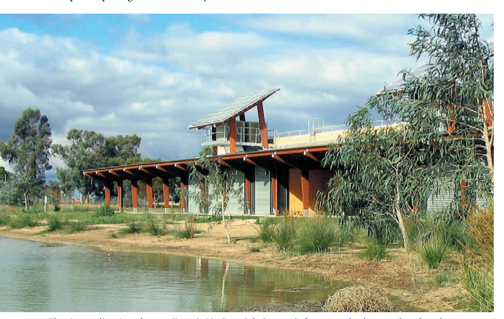
The Australian Landscape Trust's McCormick Centre informs and educates local and international visitors. {\tt Australian Landscape Trust}

Our Community is the 'national gateway' for Australia's 700 000 community groups and schools. An internet-based organisation, it provides, through 15 online Centres of Excellence, practical resources and support for community groups. It also facilitates communication between community networks and the general public, business and government in every state and territory.