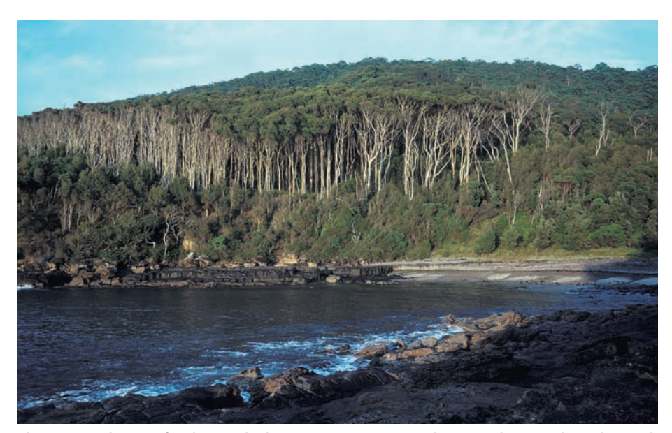
The increased store of carbon in the living vegetation is mostly in woody stems, branches and roots. These woody parts may be bigger and/or there may be more of them per area of land surface, and/or the wood may have a higher density of dry matter (thus less void space). Sandy Berry

Researchers investigating how Australian vegetation has changed since European settlement, taking into account the rapid rise in atmospheric CO_2 concentration over the last two centuries, have found that the total carbon stock in the living vegetation may have doubled. The vegetation should also have become more drought tolerant as a result of the increasing CO_2 .