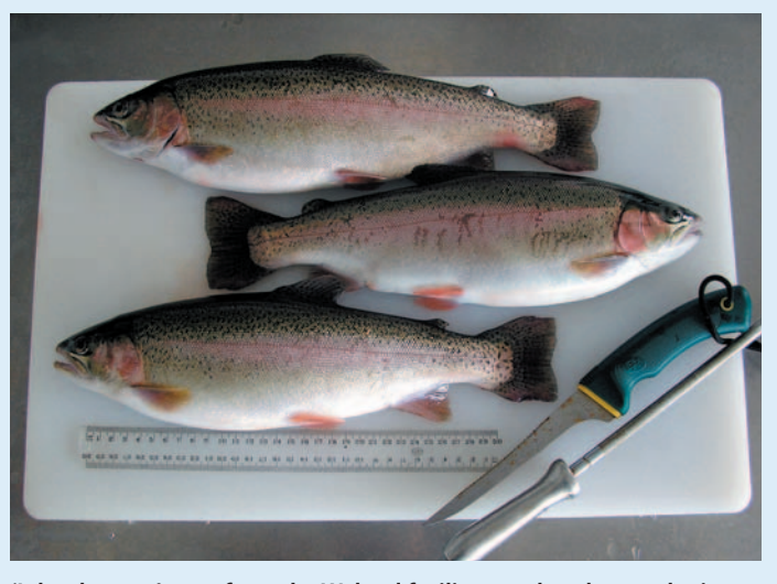
'Inland ocean' trout from the Wakool facility are already popular in the marketplace. ISARC

Could one man's problem provide another man's meat? If the Australian fish supply's future lies with aquaculture, why not exploit the continent's unwanted, saline groundwaters to grow marine or salt-tolerant fish inland?