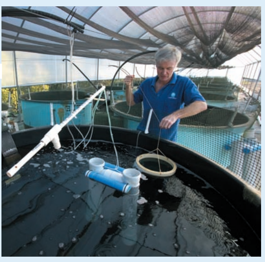
Prawn rearing tanks at the CSIRO Cleveland laboratory, south of Brisbane. CSIRO

But the European carp ( Cyprinus carpio ) is a major pest in the Murray–Darling River system and Australia is making intensive efforts to eliminate it.