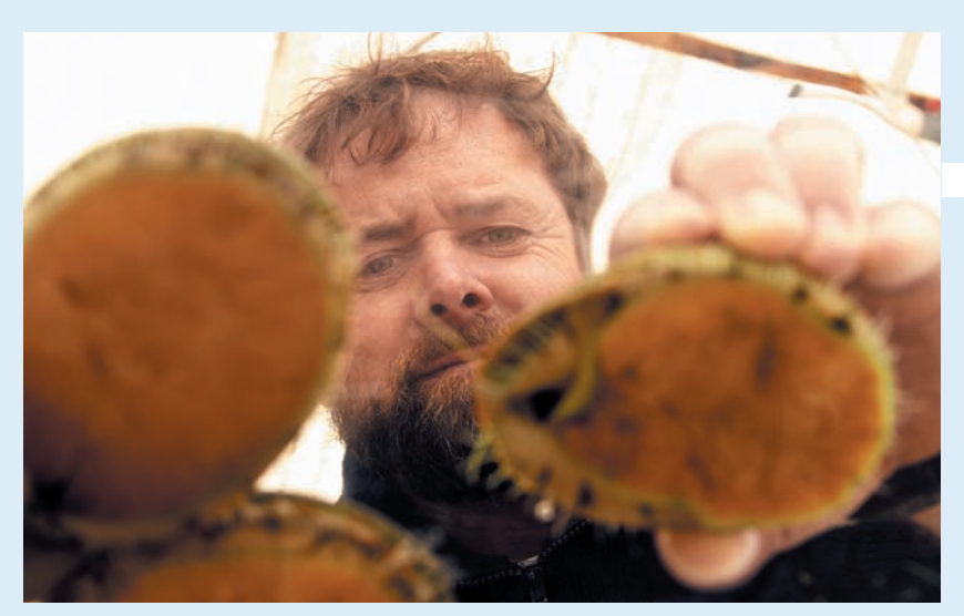
Juvenile abalone on growth plates at a Tasmanian abalone farm.