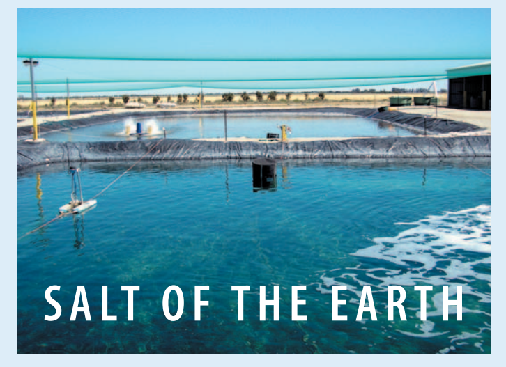
The innovative research and demonstration facility at the Inland Saline Aquaculture Research Centre, Wakool.