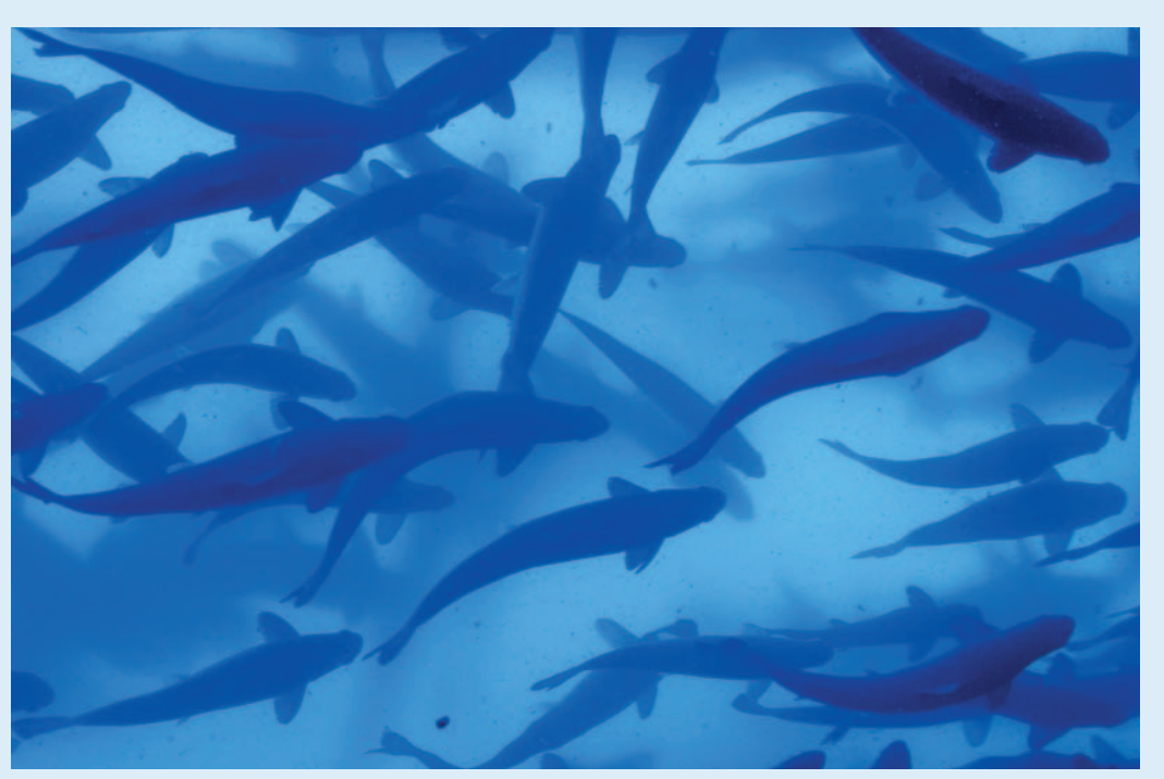
Atlantic salmon in freshwater rearing tanks at Salmon Enterprises of Tasmania, Wayatinah, Tasmania. csilo

Farmers, meanwhile, apparently have an excellent empirical knowledge for the changes that occur, and are good environmental managers. 'They have the experience of 40 years of salmon farming in Norway,