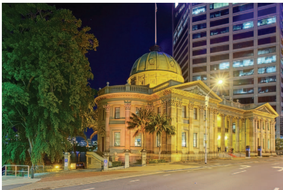
This year's Business Leaders Forum took place at Customs House in Brisbane. Customs House, University of Qld