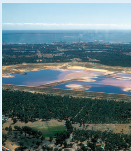
The millions of tonnes of red mud left over from alumina production could be used to neutralise acid soils and mop up other contaminants.

Haynes says good soils contain stable minerals and organic compounds that provide structure, porosity and fertility. Topsoils currently sold at nurseries and garden centres mostly contain composted green waste, which eventually breaks down and disappears.