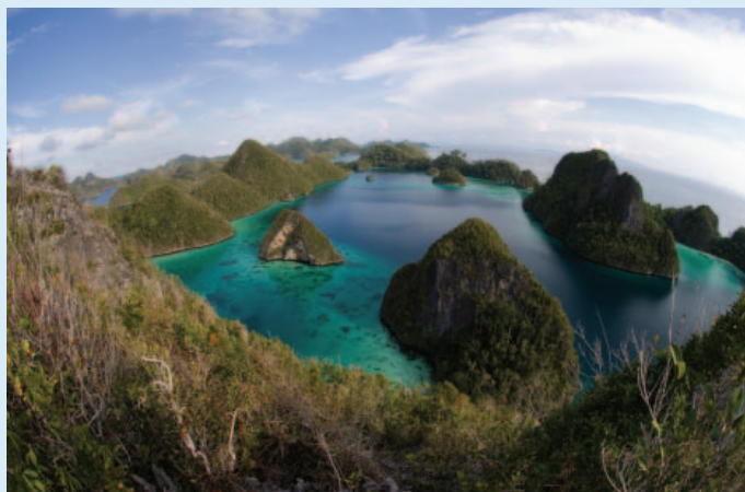
Rich in reef life – part of the Raja Ampat archipelago off West Papua.

Raja Ampat's marine environment has been