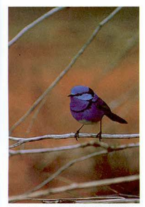
From left: a male splendid fairy wren, a little wattlebird, and a male flame robin.

fingerprint revealed by their enzymes, the sittella and the nuthatch are nowhere near as closely related as their great similarities suggested to earlier ornithologists.