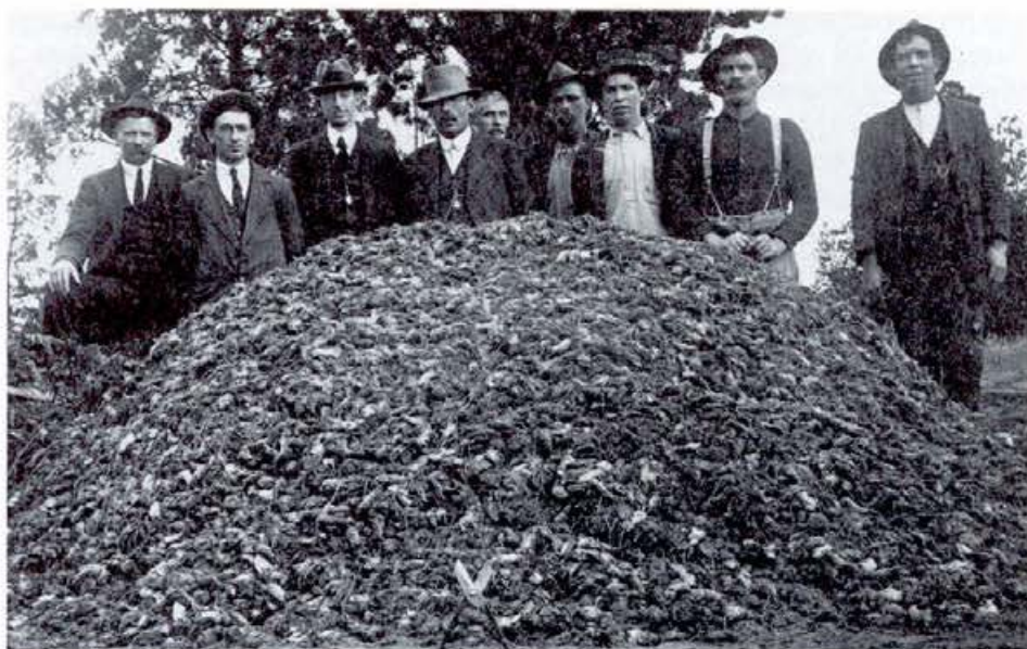
The result can be hordes of the creatures — as shown here after 4 nights of trapping during the 1917 plague in Lascelles, Victoria.