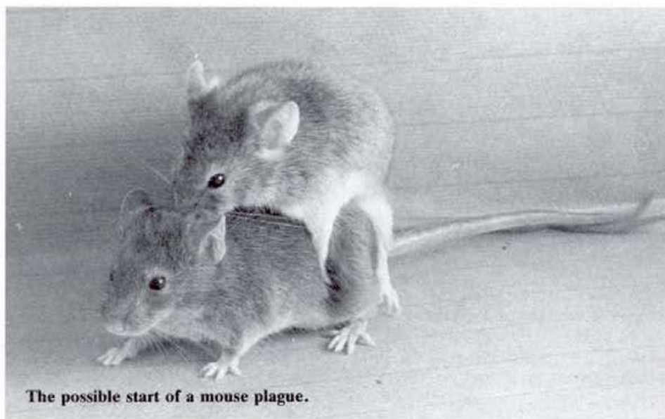
The possible start of a mouse plague.

According to this model, the original environmental trigger of the 1979/80 plague was the above-average rainfall that occurred in the autumn of 1978 — nearly 2 years before the main population increase. The good rains meant that high-quality food remained available further into autumn than usual; this, in turn, extended the breeding season.