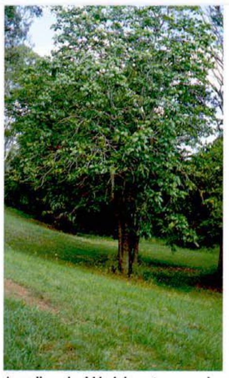
A medium-sized black bean tree, popular in gardens.

Of course, it's a big leap from cells in a culture flask to a person dying of AIDS. We don't yet know how effective castanospermine will be at inhibiting viral growth when in the complex chemical environment of the human body, nor do we know how bad its side-effects may be. But the encouraging results in the laboratory make