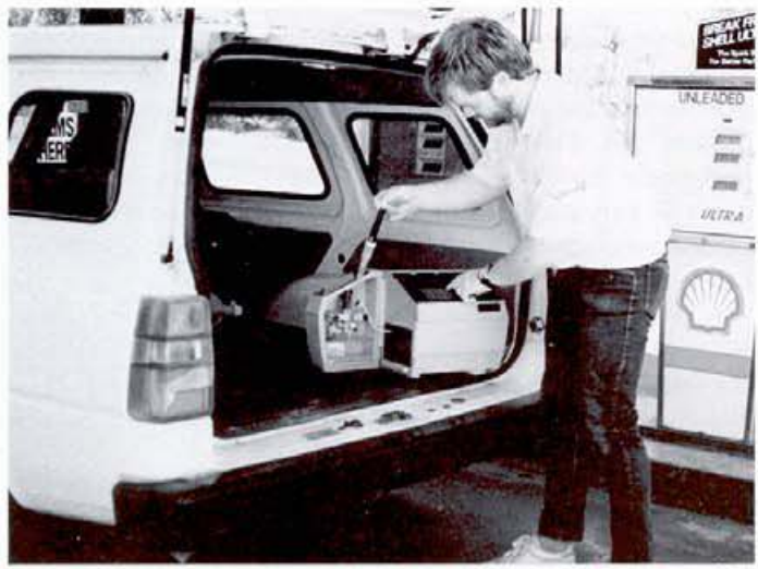
A portable trace-metal laboratory in the boot.

They found a unique electrolyte recipe that happily fulfilled the latter requirement. It calls for an alkaline solution of sodium chloride mixed with ascorbic acid (yes, vitamin C) as the antioxidant. The other requirement, for a permanently wet electrode, was trickier, but was finally