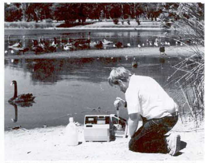
What's the level of heavy metals in this lake? Wait a minute and I'll tell you.