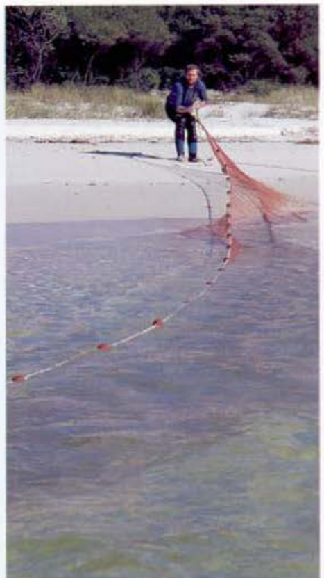
Sampling the fauna of shallow, sandy bottoms.

'Holes' in the seagrass — created in the 1960s by underwater explosions — are still present.