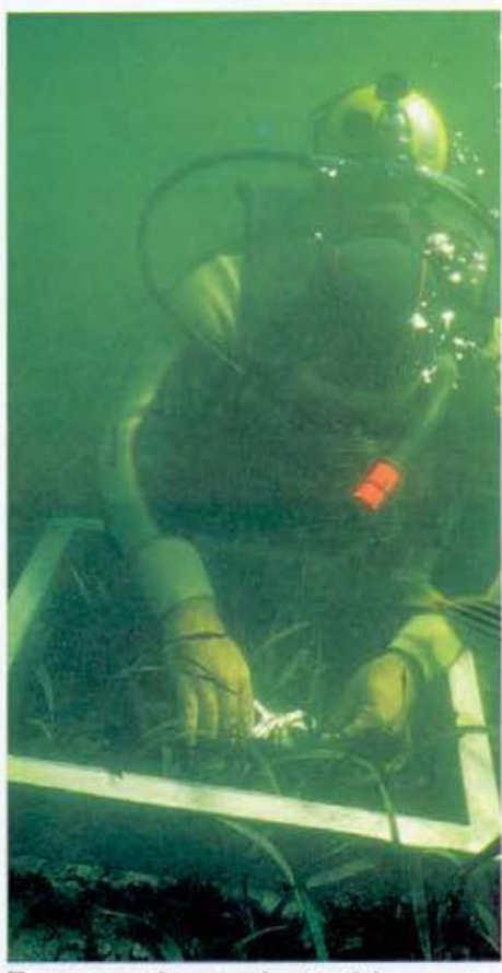
To measure the growth rate of the seagrass Posidonia , scientists punch holes in the leaves and their bases, and return at known intervals to measure the increasing distance between them.