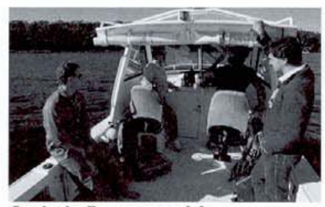
Out in the Bay on a good day.

Early results from the Jervis Bay study have highlighted a puzzle for the researchers. Sampling of sandy beaches to a depth of only 2 m — a rather unglamorous and comparatively poorly studied region for marine biologists — revealed that commercially and recreationally valuable fish were more abundant there than in the seagrass meadows sampled by the State Department of Agriculture and Fisheries.