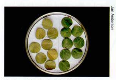
The bronzing effect of UV-B shows up clearly in the leaves on the left, which have had supplementary UV exposure for 20 days. Those on the right are the same age but received no extra UV.

Proteins and nucleic acids, molecules vital to life, absorb radiation in the UV-B and UV-C bands. That is why this type of ultraviolet radiation is most damaging to living things.