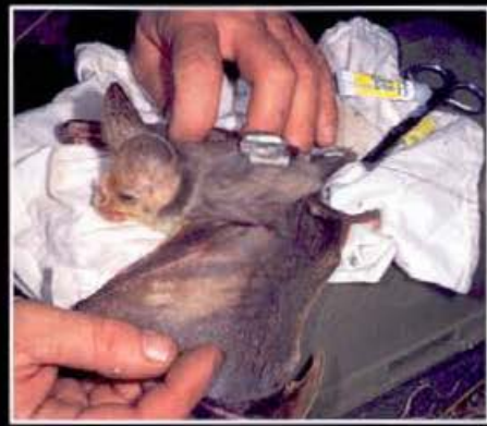
A scientist attaches a radio transmitter to a ghost bat as part of the first intensive study of this little-known species' biology. A quick-setting adhesive is used to attach the transmitter, which operates continuously for several days. Constant grooming by the bat gradually loosens the transmitter until it