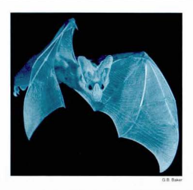
Researchers are at last getting to know this 'gentle giant' among carnivorous bats

magine a predator so powerful and formidably armed it can kill and eat creatures weighing as much as itself, and so superbly evolved it hunts by sight, by sound and by echo-location. It may sound like something out of a science-fiction horror movie, but such a predator exists - and it has an incongruous reputation for gentleness and shyness.