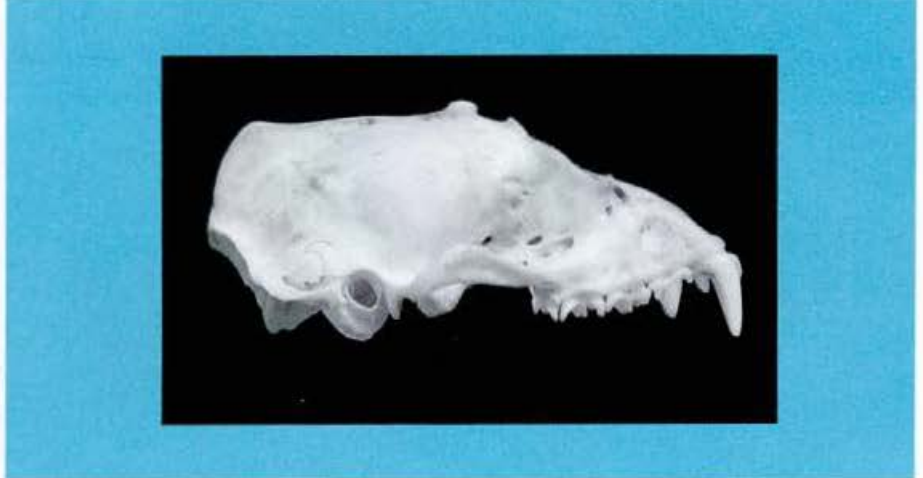
Despite its fearsome dentition and powerful jaws, the ghost bat is remarkable for its tame disposition; it rarely attempts to bite, unlike smaller and less well-armed insectivorous bats.

Ghost bats can now be found only in seven confirmed and three probable widely scattered populations: in Queensland, around Rockhampton, Cape Hillsborough, Chillagoe and Camooweal and possibly Cape York; in the Northern Territory around Pine Creek and possibly in Arnhem land; and in Western Australia in the Kimberleys and the Pilbara and possibly at Kalumburu Mission in the far north of the State (see the map).