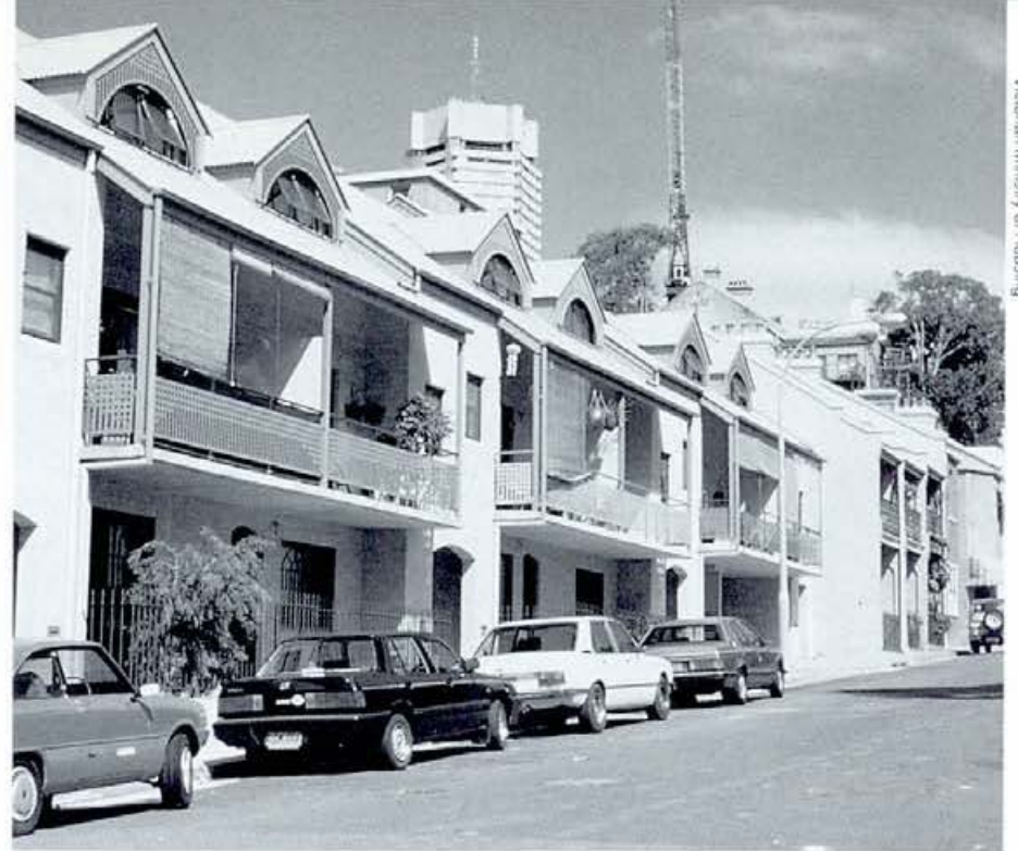
Old with the new; new terrace houses have been built alongside their 19th century counterparts in the inner Sydney suburb of Woolloomooloo.

The growth regions include far outer Sydney, the mid-north coast of New South Wales, far eastern Melbourne, eastern Victoria, far outer Brisbane, the Gold Coast, far northern Queensland, most of Perth and southern and eastern Adelaide. The displacement regions include the older suburbs of Melbourne and Sydney where 'gentrification' is taking place. The marginalised areas