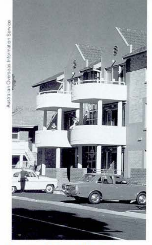
Contemporary inner-city housing.

is becoming for many the main reason for leaving the inner and middle city suburbs and heading for the urban fringe or beyond.