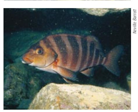
Main picture: Pope's Eye, a protected oasis of sea life near the mouth Port Phillip Bay. Inset top: Blue devilfish are among the hundreds of species found at Pope's Eye. Inset above: A banded Morwong at Tasmania's Governor Island Marine Reserve.

Overfishing is threatening species such as Atlantic halibut and orange roughy, and scientists and ecotourism operators are demanding pristine seabeds to study and explore. Governments, scientists, conservationists and industry groups are considering Marine Protected Areas (MPAs), including