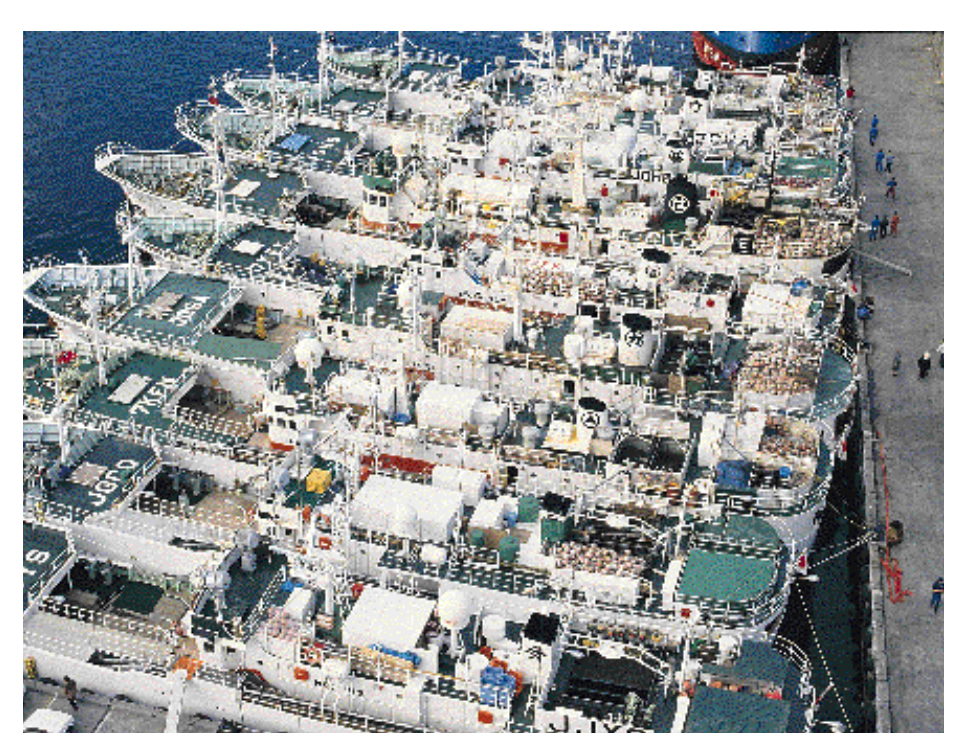
Fishing vessels at Hobart wharf. The fishing industry, while acknowledging the importance of marine conservation, argues that Tasmanian waters already are fished on a sustainable basis.

'Small MPAs often are chosen at a similar scale to the daily movements of their resident fish species, with these movements resulting in a substantial loss to adjacent fished areas,' Barrett says. 'In addition, small MPAs would rarely contain the volume of fish required to repopulate fish stocks over a wider area.